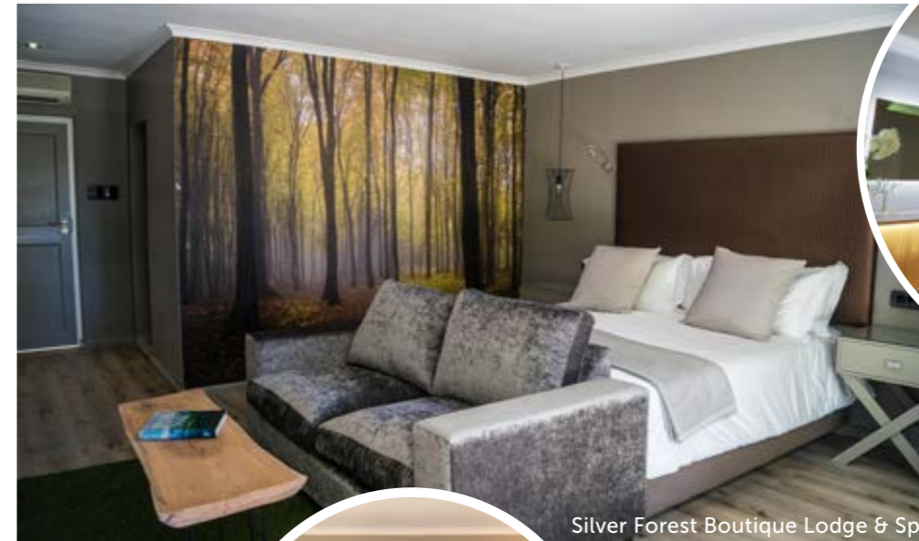
Silver Forest Boutique Lodge & Spa

Text: Nicky Furniss