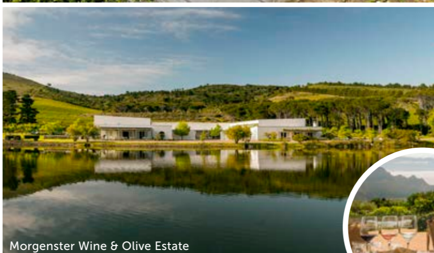
Morgenster Wine & Olive Estate