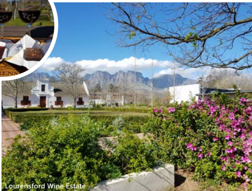
Lourensford Wine Estate