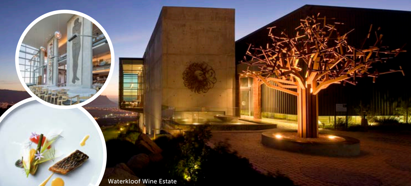
Waterkloof Wine Estate